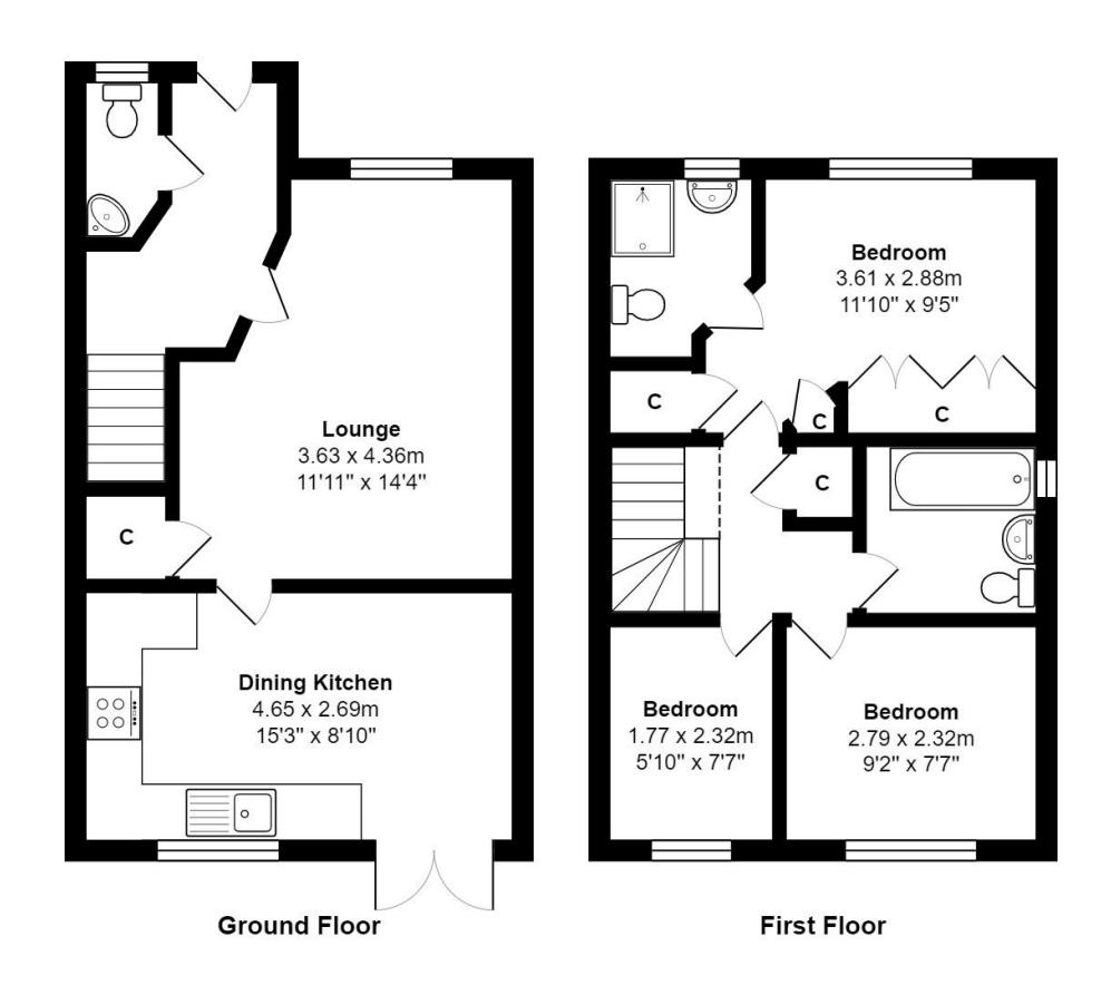
Total Area: 69.2 m² ... 745 ft²

All measurements are approximate and for display purposes only