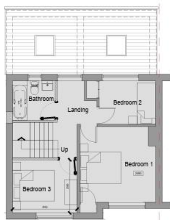
First Floor Plan (Proposed)