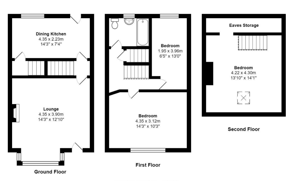
\label{eq:total_state} Total\ Area: 87.0\ m^2\ ...\ 936\ ft^2 All measurements are approximate and for display purposes only